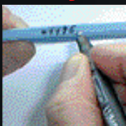
Identify content by writing on sides.