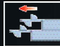
To close, slide upper UniMailer™ forward until locking pins are engaged.

Not only do UniMailer™ slide mailers fit snugly on top of each other but are secured by an innovative locking mechanism.