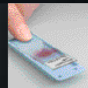
Press on slide to lift and remove.