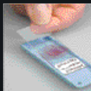
Place slide in tray.