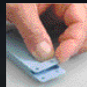
To open, slightly lift front tab to disconnect lock and slide back upper UniMailer™.