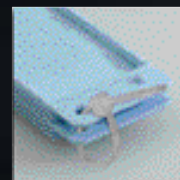
If desired, you can attach a tamperproof tie.