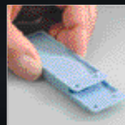
Place another tray on top and slide forward until a click is heard.